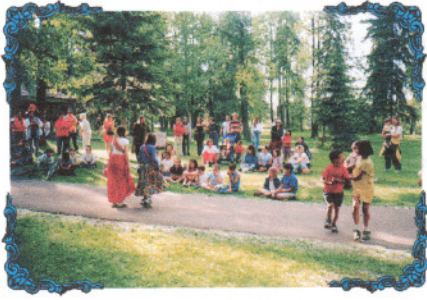
June 19, 2001 Aboriginal Community Council Dinner at Rotary Park